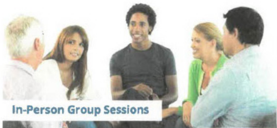
In-Person Group Sessions

There's never been a more Important time to quit.