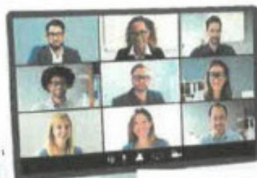
Virtual Group Sessions